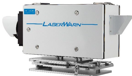
LaserWarn™ Open-Path Chemical Detection System for Security and Safety

LaserWarn™ is a laser-based chemical identification system for protection of people and facilities against potential chemical threats. The system can detect multiple chemicals within seconds over thousands of square meters, including chemical warfare agents (CWAs), toxic industrial chemicals (TICs), and emerging threats.