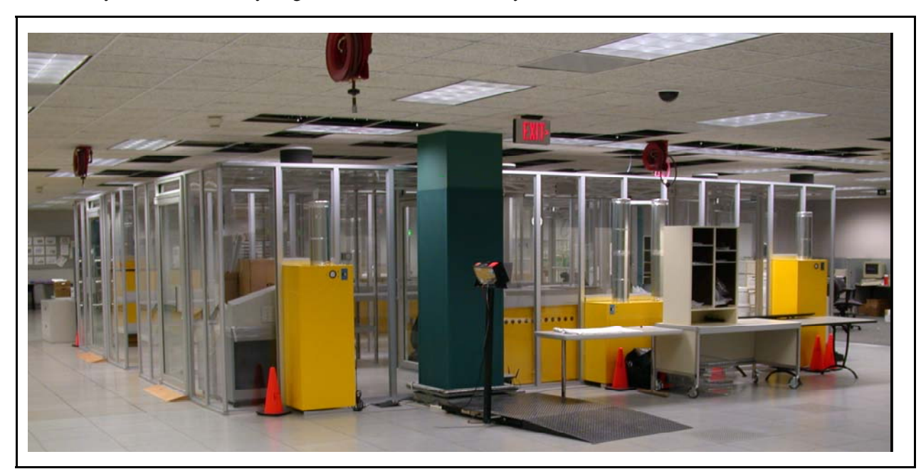
Installed Negative Pressure Mail Room (NPMR).

The cost of consumables in these systems is kept to a minimum. For example, disposable bioassay coupons are used that can be reused many times over a 48-hour period: 30 times for the RAPTOR or 10 times for the BioHawk. This system is designed to be operated by mailroom personnel and is fully automated, requiring little operator assistance. As an example, at the beginning of the day the operator need only insert a bioassay coupon and refill fluids- operations that can be completed in 10 minutes or less. The system is then ready to go unattended for a full day.