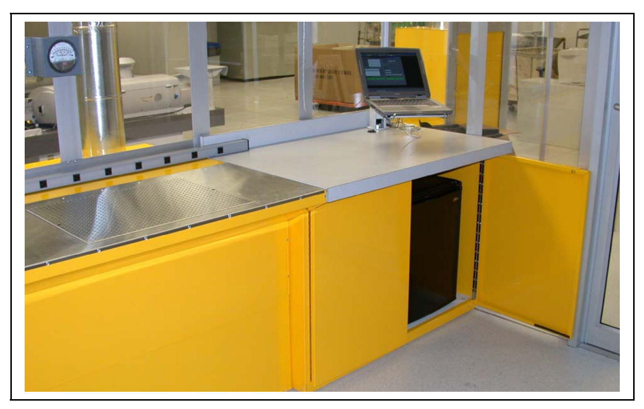
Downdraft table with open cabinet door where ASAP II system is located. The laptop computer on which ASAP II control software is installed is also shown.