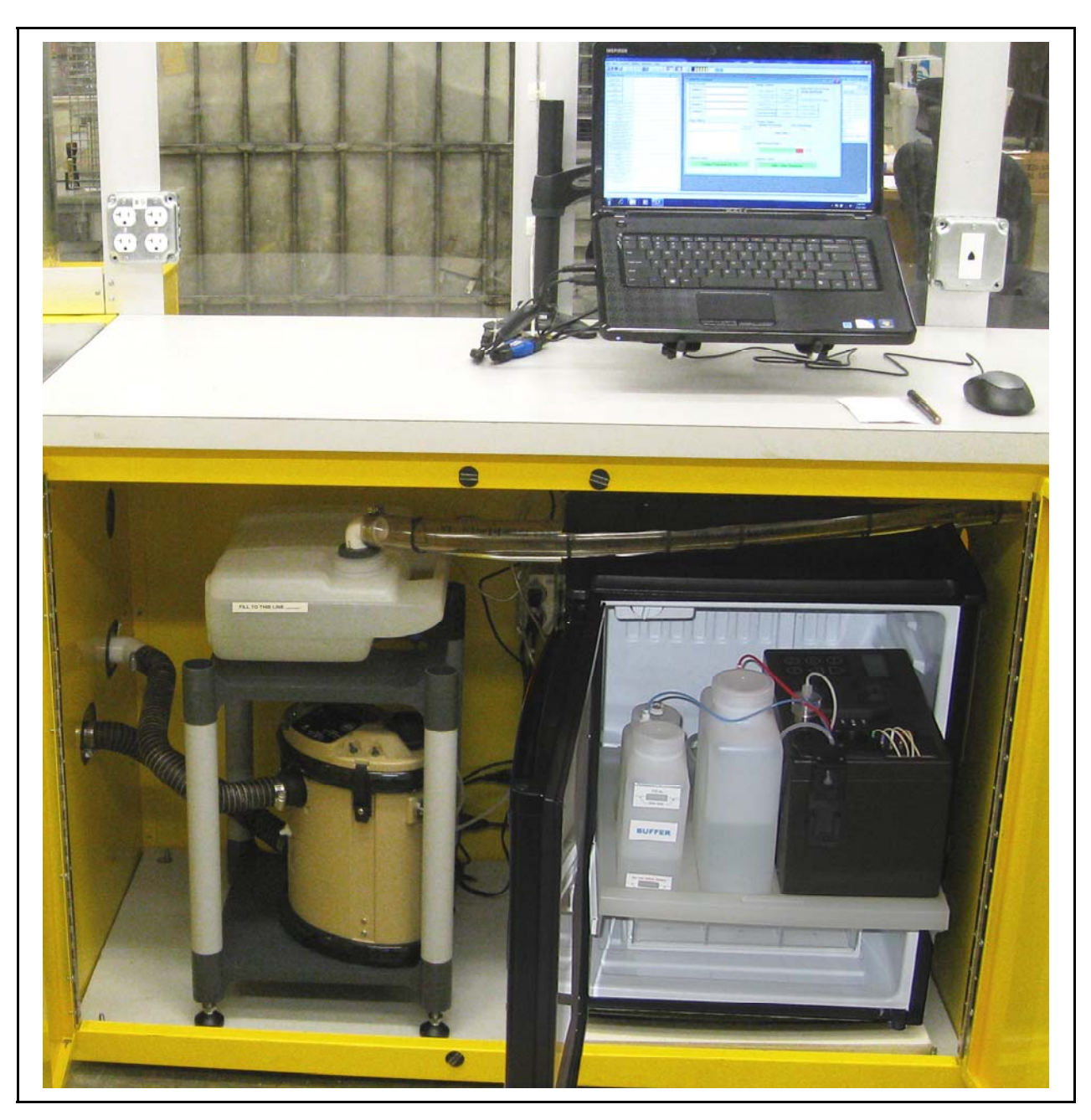
Cabinet space below downdraft table, which houses SASS air sampler on the left and environmental chamber where RAPTOR or BioHawk module is located, on the right.

The ASAP II system may also include automated chemical, explosives and nuclear detection. Subsystems currently specified for these targets include: the Mobile Trace explosive particle and vapor detection system from Morpho Detection (formerly GE Security); the ChemProFX chemical detection system from Environix OY; and the TSRM82 Gamma Radiation Detector, manufactured by VNIIA. The chemical and explosives detectors sample air through the same proprietary sampling structure used by the biodetection subsystem. This structure has been designed to provide each instrument with an air sample that is a statistically valid representation of air flowing through the downdraft table, independent of the target's