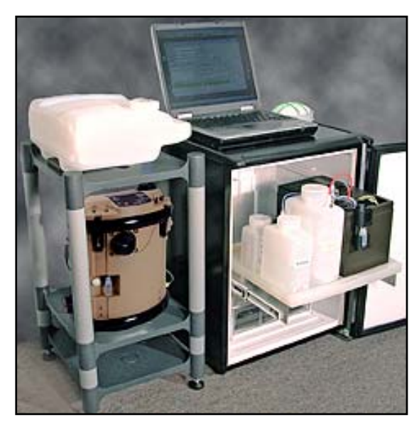
Research International's ASAP II system.