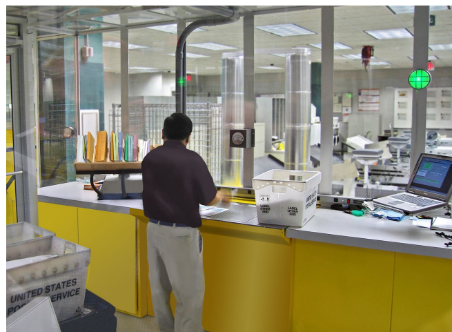
An operator sorting mail over a downdraft table. ASAP III control software runs on the laptop, while detection instruments are installed under the counter.