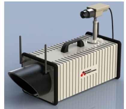
Infrared spectral-based toxic gas detector. Uses no consumables.