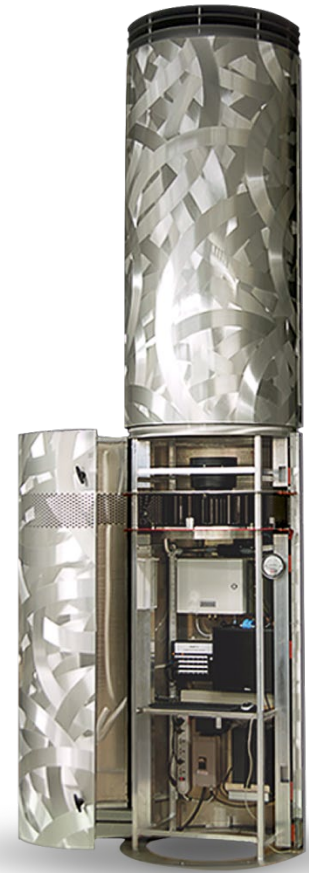
ASAP V system showing internal sensors.

Body temperature imaging (8 to 14 microns, typ.) is an excellent method for performing covert surveillance or fire detection, among other functions. Advancements in thermal camera technologies have now made this cost-effective to incorporate into the ASAP V. Thermal imagers can be installed with arrays ranging up to 640 x 480 (VGA) in size.